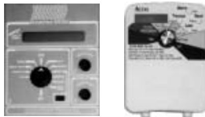
Figure 1. Two examples of ET controllers

A new generation of controllers, called ET based controllers, has recently become available that uses a measure of plants' water requirement called "Evapotranspiration" (ET). ET is used to schedule watering based on historical climate for a locale and is a measure of the rate of a plant's water requirement that involves plant transpiration and soil evaporation.