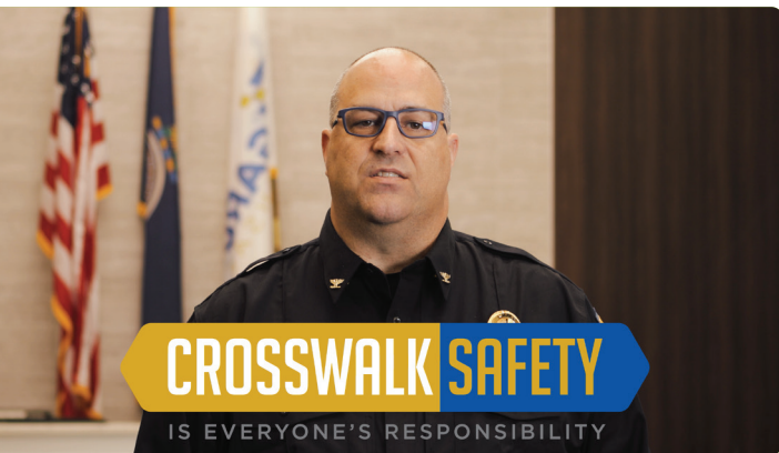
Chief Belcher's crosswalk safety video, safety tips, a traffic signal guide, a quiz and more can be found at www.gardnerkansas.gov/crosswalksafety .

For questions regarding the city's crosswalk safety efforts, contact the Gardner Police Department at (913) 856-7312.